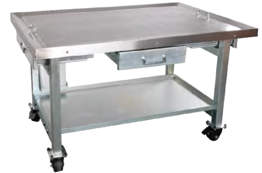
Part Code: TT-B