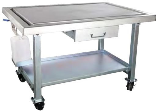
Part Code: TT-A