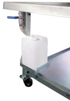
Wasted Oil Collector