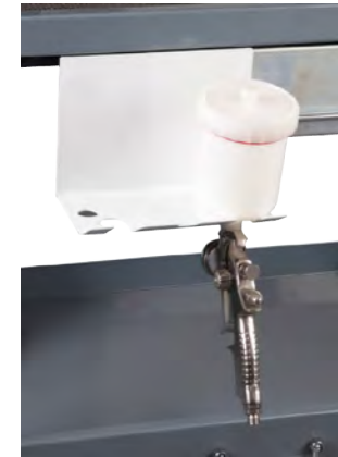
Part Code: GH-A