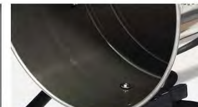
Stainless Steel Barrel