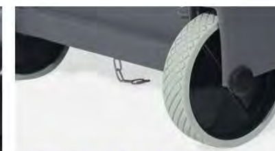
Universal Rubber Wheel