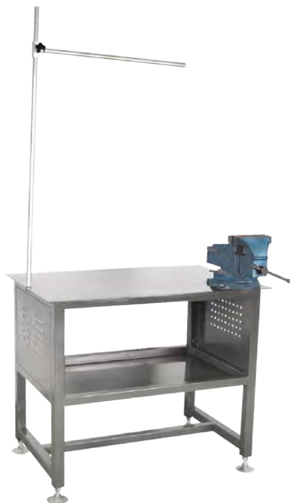
Part Code: SWB-A