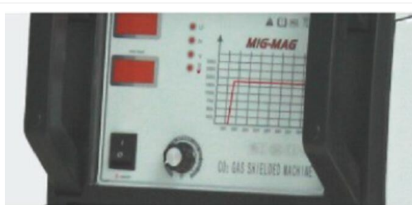
Displaying the voltage and current, monitoring 3 phase network voltage and marking welding characteristic curve.