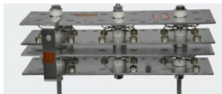
Multilayer silicon rectifier bridge with the advantages of fast heat dissipation and stable welding current.