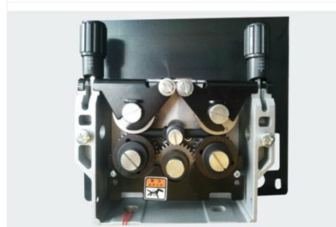
Wire Feeder with a four-roll dual drive system.