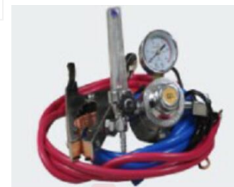
This decompressor is with sintered bronze filter for preventing impurity from entering the gas regulator to ensure the use well and extend the service life.