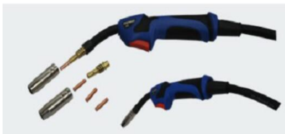
High Quality CO2 Welding Torch with thickened copper pipe from European premium brand.